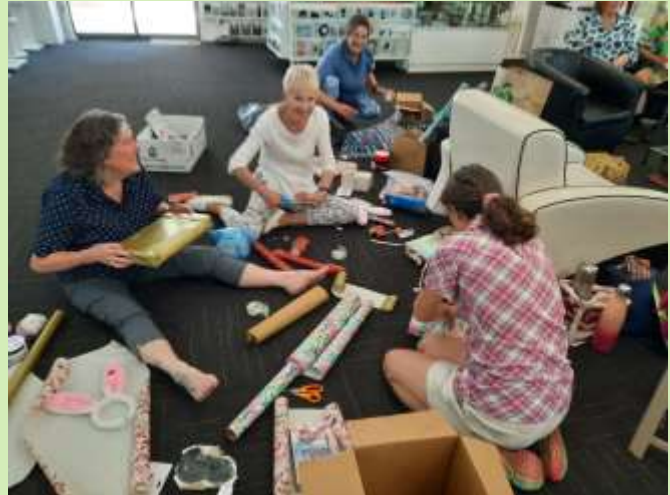
Wrapping prizes for the write a haiku poem lucky dip for The Expo